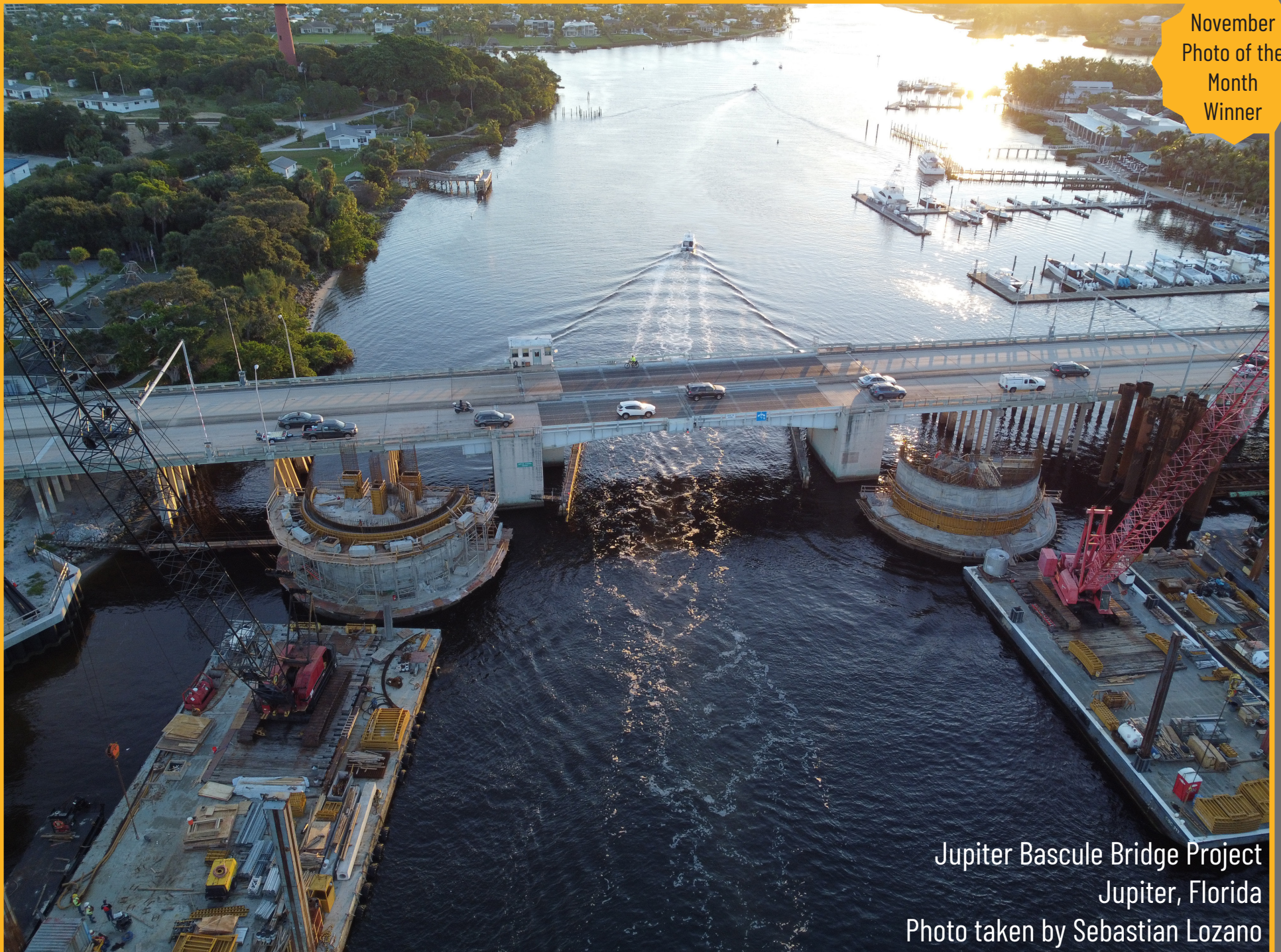
Jupiter Bascule Bridge Project Jupiter, Florida