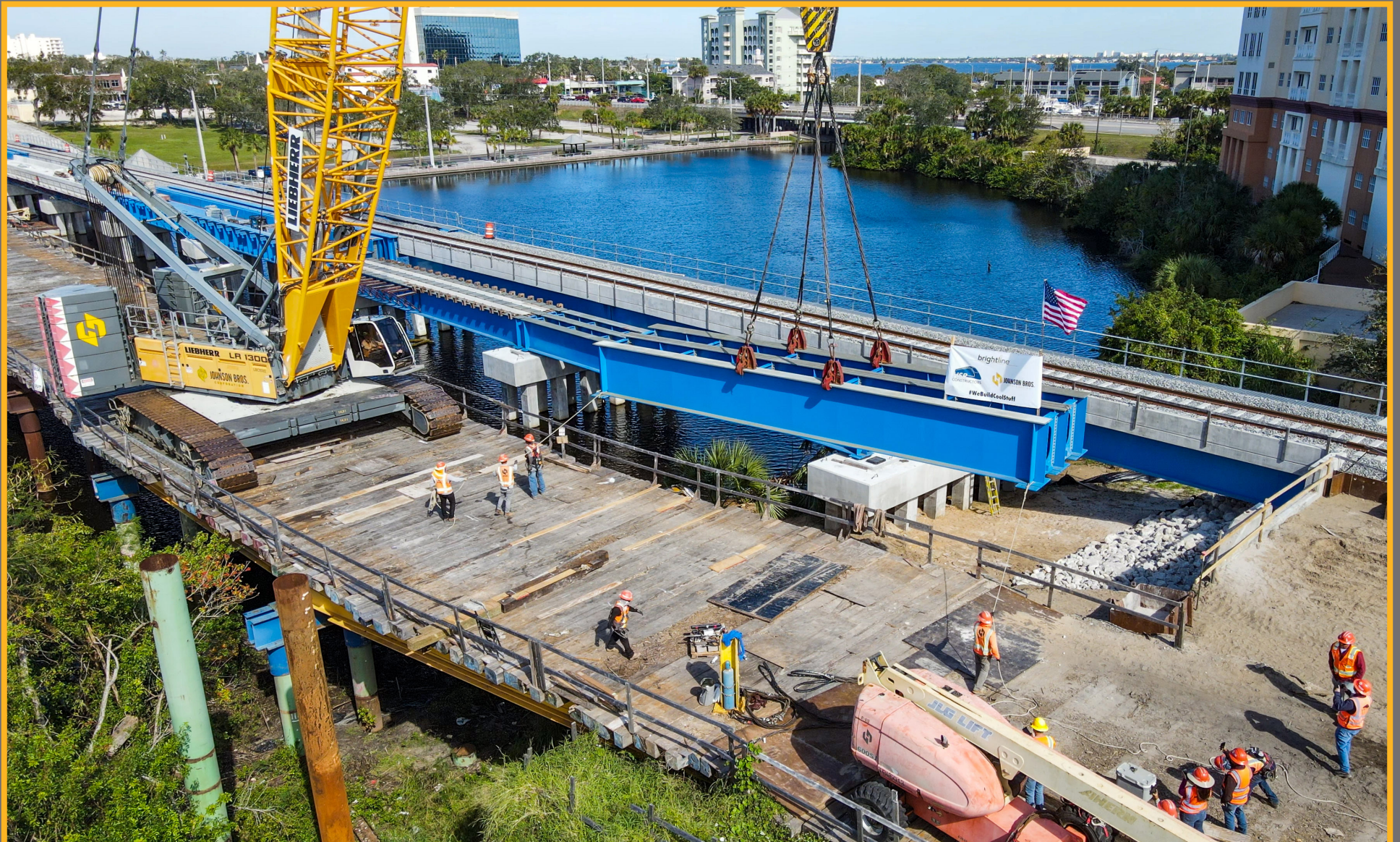
Brightline Zone 4 Phase II West Palm Beach, Florida