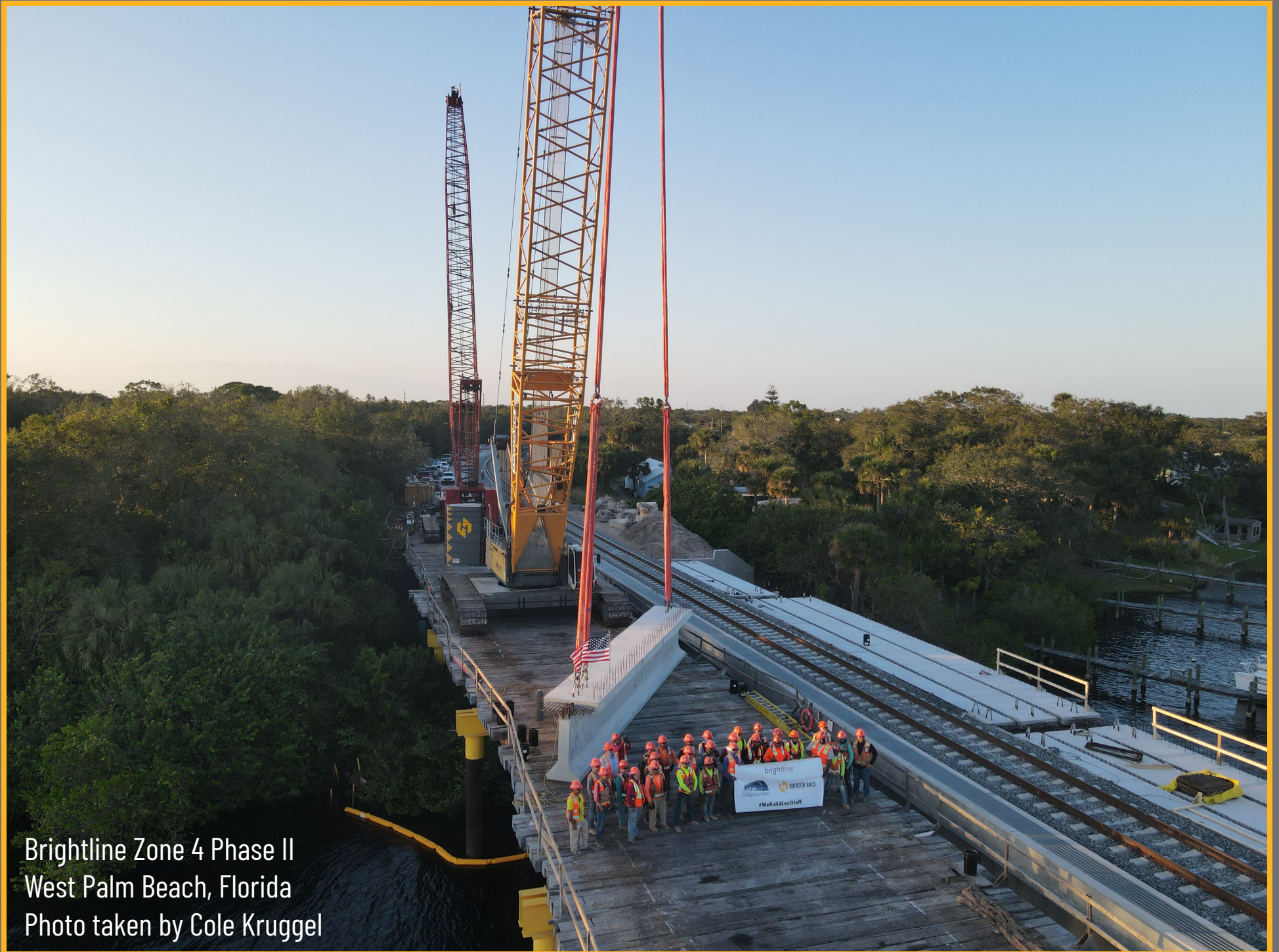
Brightline Zone 4 Phase II West Palm Beach, Florida