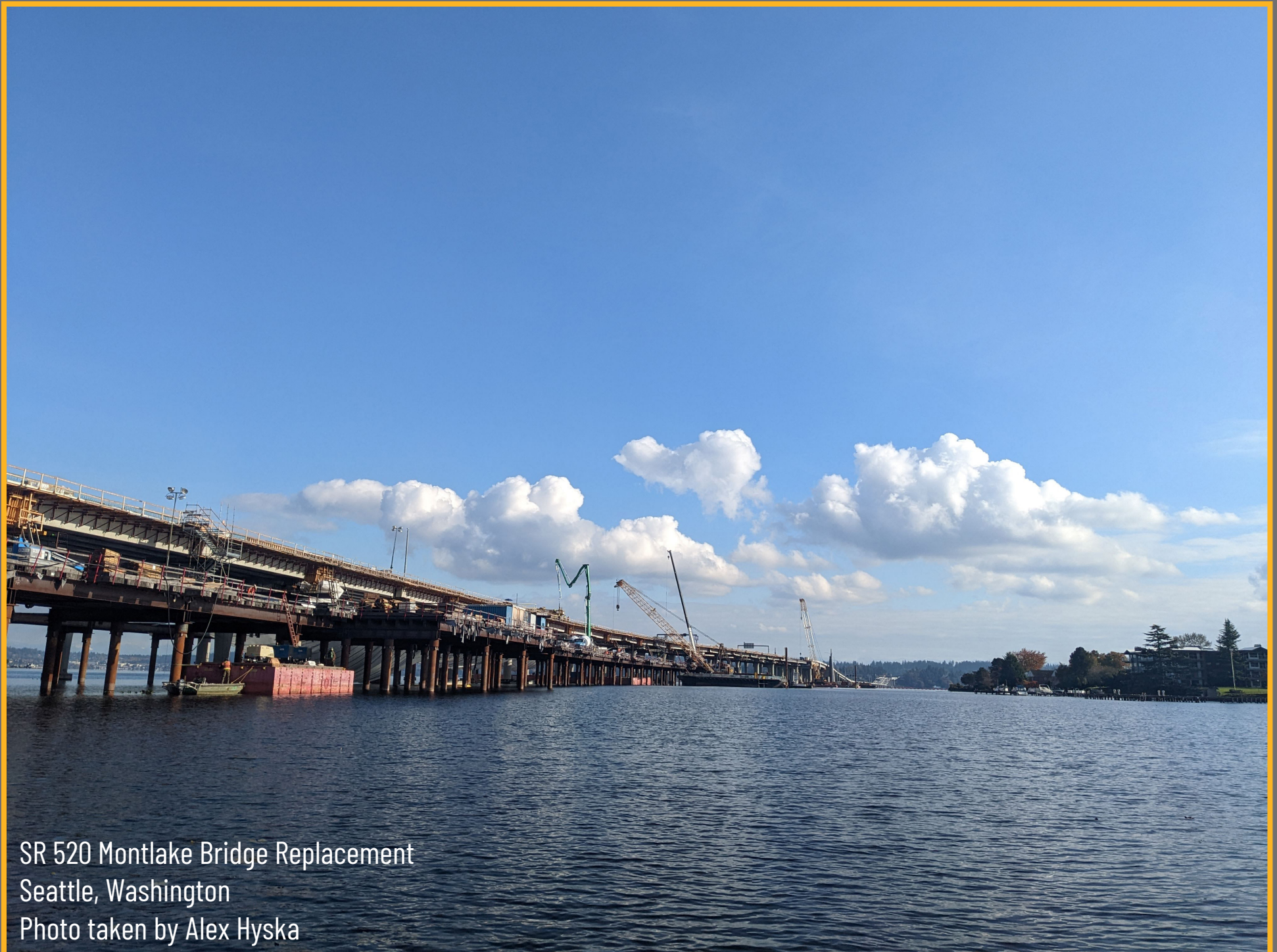
SR 520 Montlake Bridge Replacement Seattle, Washington