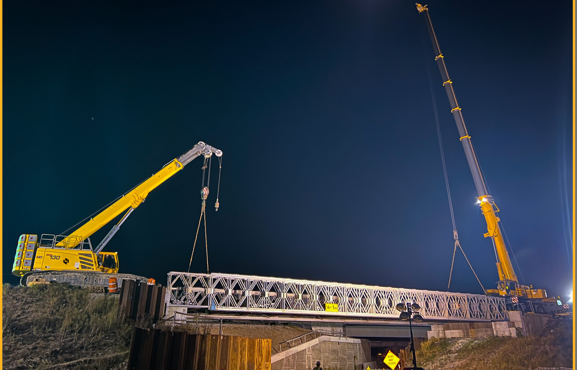
ARDOT IH 30 Saline County Benton, Arkansas