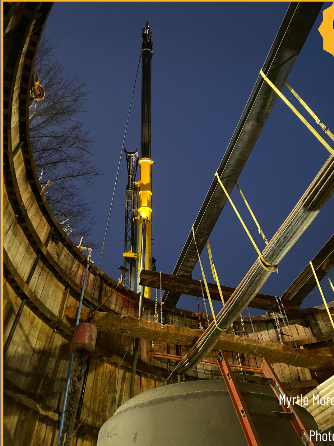
Myrtle Morehead Storm Drain Project Charlotte, North Carolina