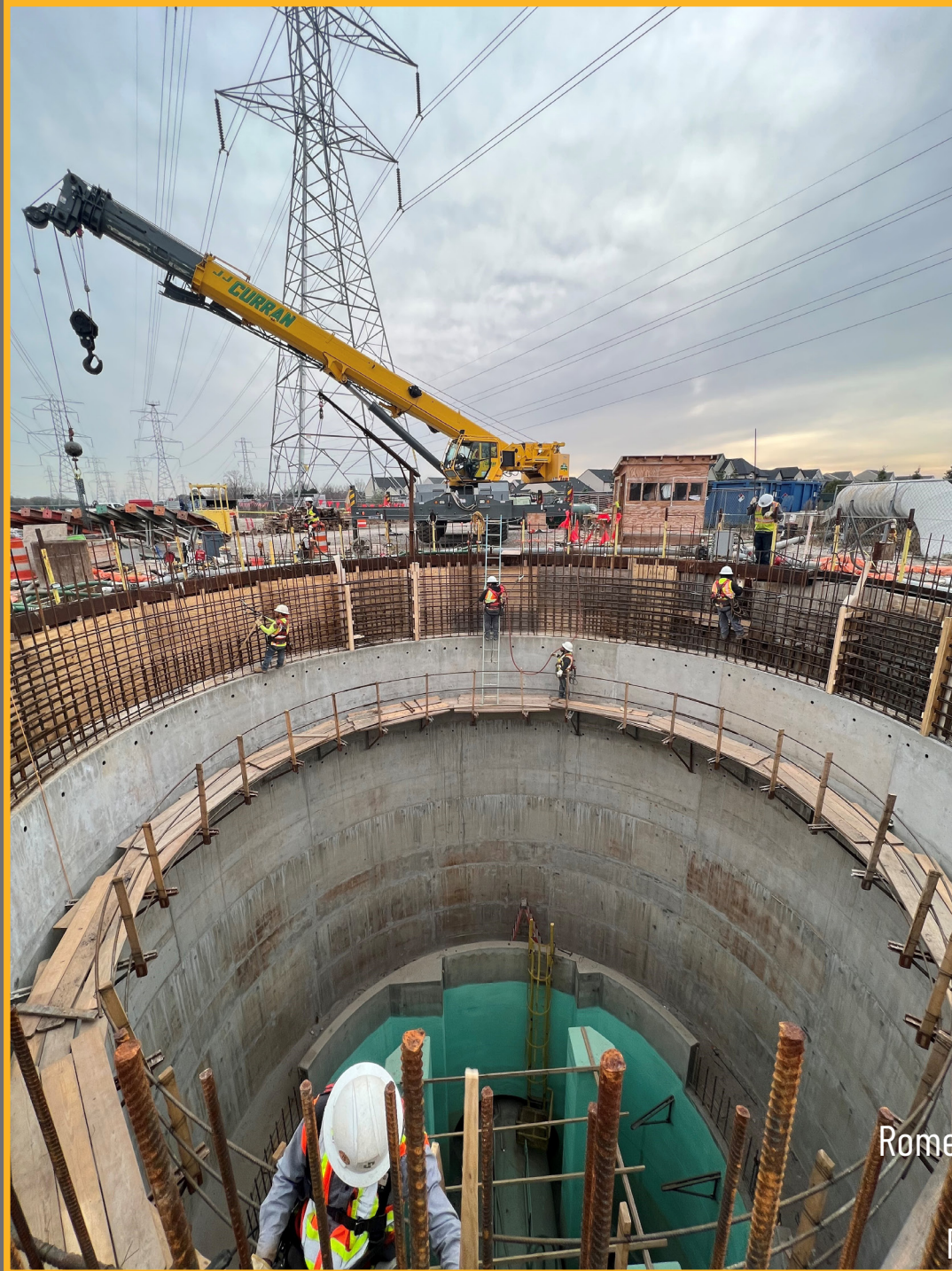
Romeo's Arm Lining Segment 5 Sterling Height, Michigan