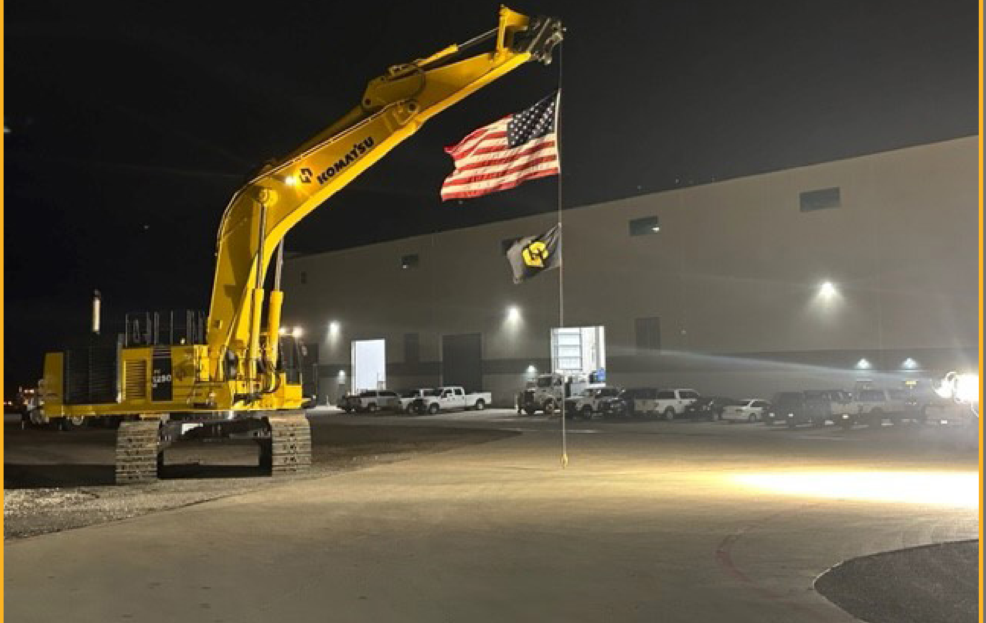
Burleson Equipment Yard Burleston, Texas