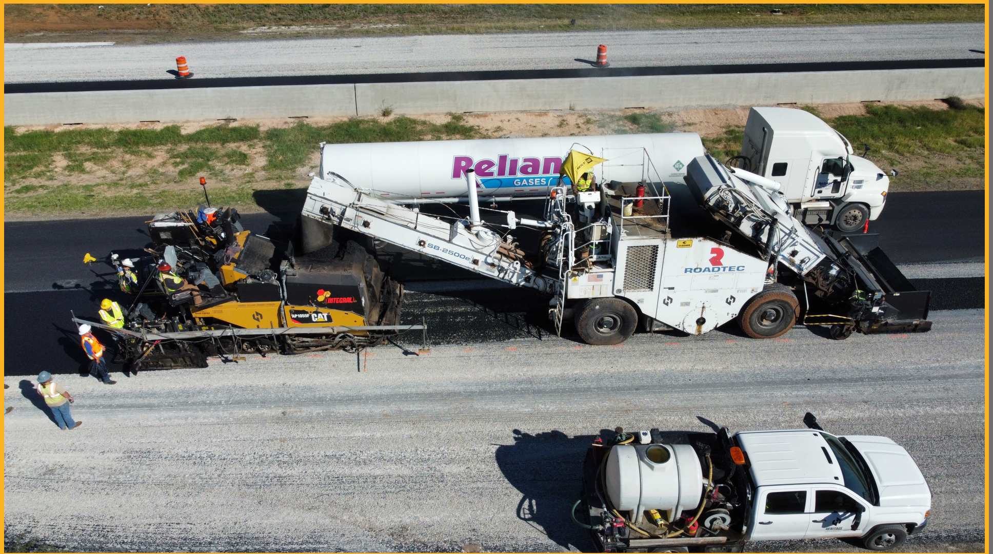
IH Nolan County Sweetwater, Texas